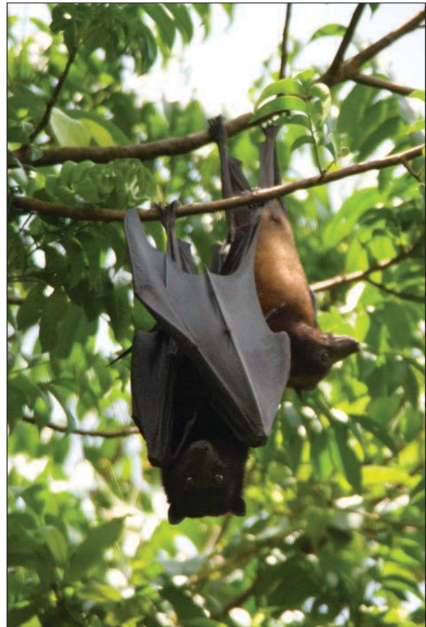
Fig. 1 Flying foxes on Koh Trong Island on the Mekong River (left) and Koh Bong Island off the coast of Cambodia (right). The species on the left is thought to be P. lylei and the species on the right P. hypomelanus .

confirmed by checking roost trees with a spotlight after the dispersal count at each site. Due to the density of bats and brevity of the evening dispersal, in some instances bats were counted in groups of 10 as they dispersed. The higher count from the two methods was rounded down to the nearest hundred and accepted as the estimated population size for a given site. Interviews were also undertaken by the first author with local authorities and residents at roost sites to determine: (i) the status of the colony (permanent or seasonal); (ii) annual breeding periods (defined as birth periods); (iii) whether the colony receives any protection; (iv) conservation threats at each site; and (v) local perceptions concerning the flying fox colony.