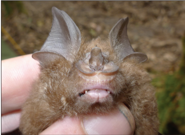
Fig. 2 Rhinolophus yunanensis : CBC01208, Phnom Samkos Wildlife Sanctuary.