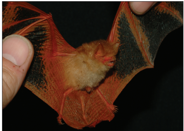
Fig. 7 Kerivoula picta : CSOCA272, Preah Vihear Protected Forest.