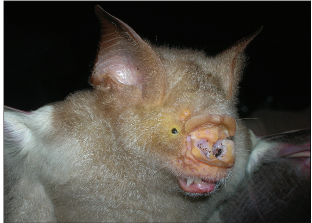
Fig. 3 Hipposideros diadema : CBC01146, Veun Sai Proposed Protected Forest.