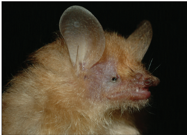
Fig. 6 Murina cyclotis : CSOCA266, Preah Vihear Protected Forest.