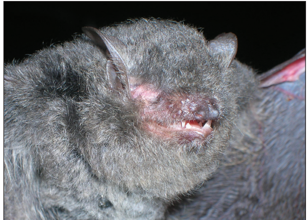
Fig. 5 Myotis horsfieldii : CBC01142, Veun Sai Proposed Protected Forest.