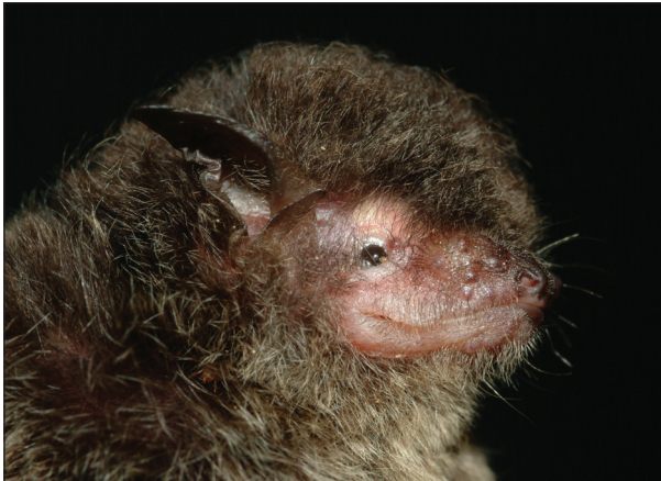
Fig. 4 Myotis ater : CBC00620, Veun Sai Proposed Protected Forest.